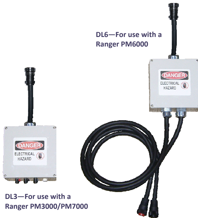
DL3—For use with a Ranger PM3000/PM7000

Note: * units come with 4 banana to banana for voltage connections and 3 BNC to BNC for current connection